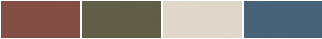
rostrat U335 ST9