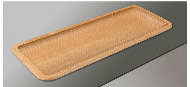
Large storage tray