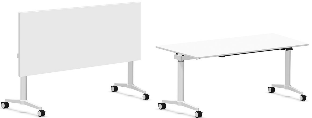
VARIO MOVE Sit-stand table