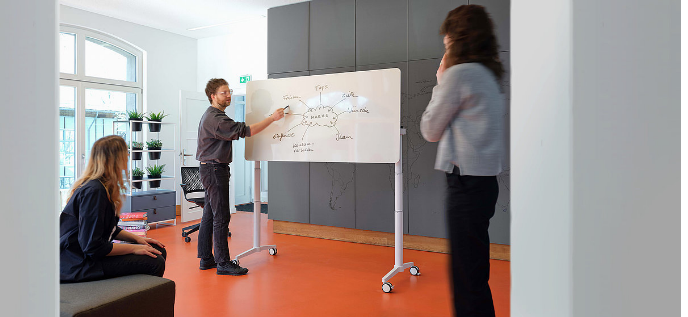
VARIO MOVE Sit-stand table, [Translate to English:] Whiteboardfunktion