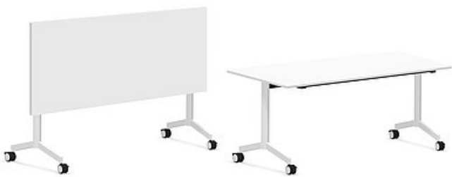
MOVE fixed height