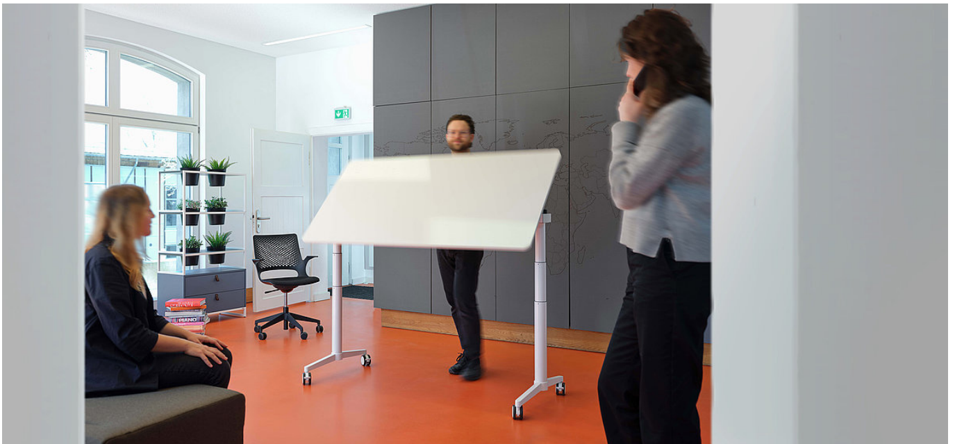
VARIO MOVE Sit-stand table, [Translate to English:] mit abklappbarer Tischplatte