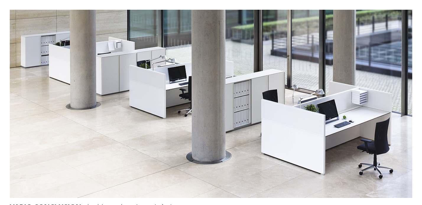
VARIO CONCLUSION , double workstations vis à vis