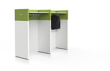
CONCLUSION Coat Rack