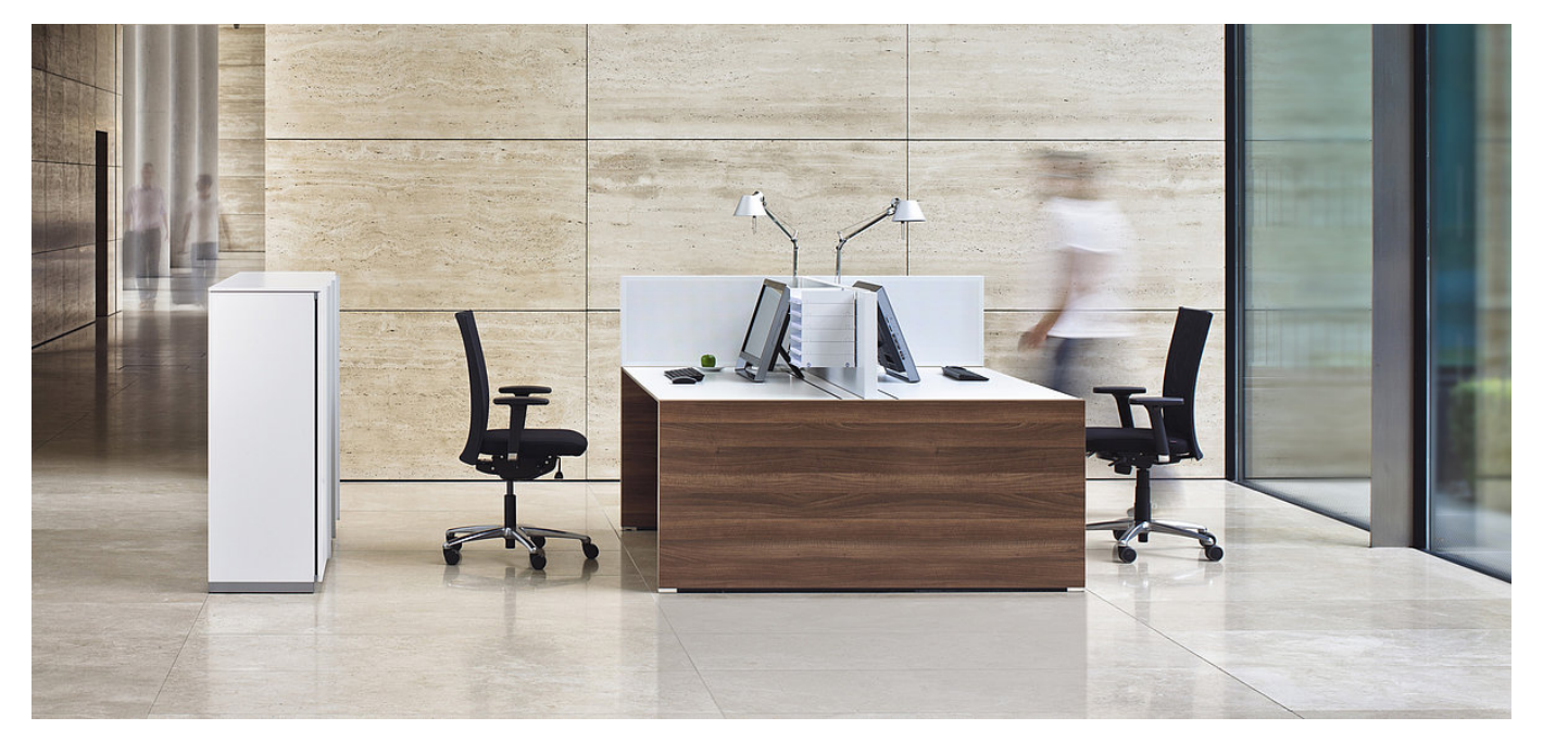
VARIO CONCLUSION , double workstation vis à vis