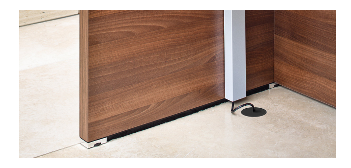
vertical cable duct, magnetic