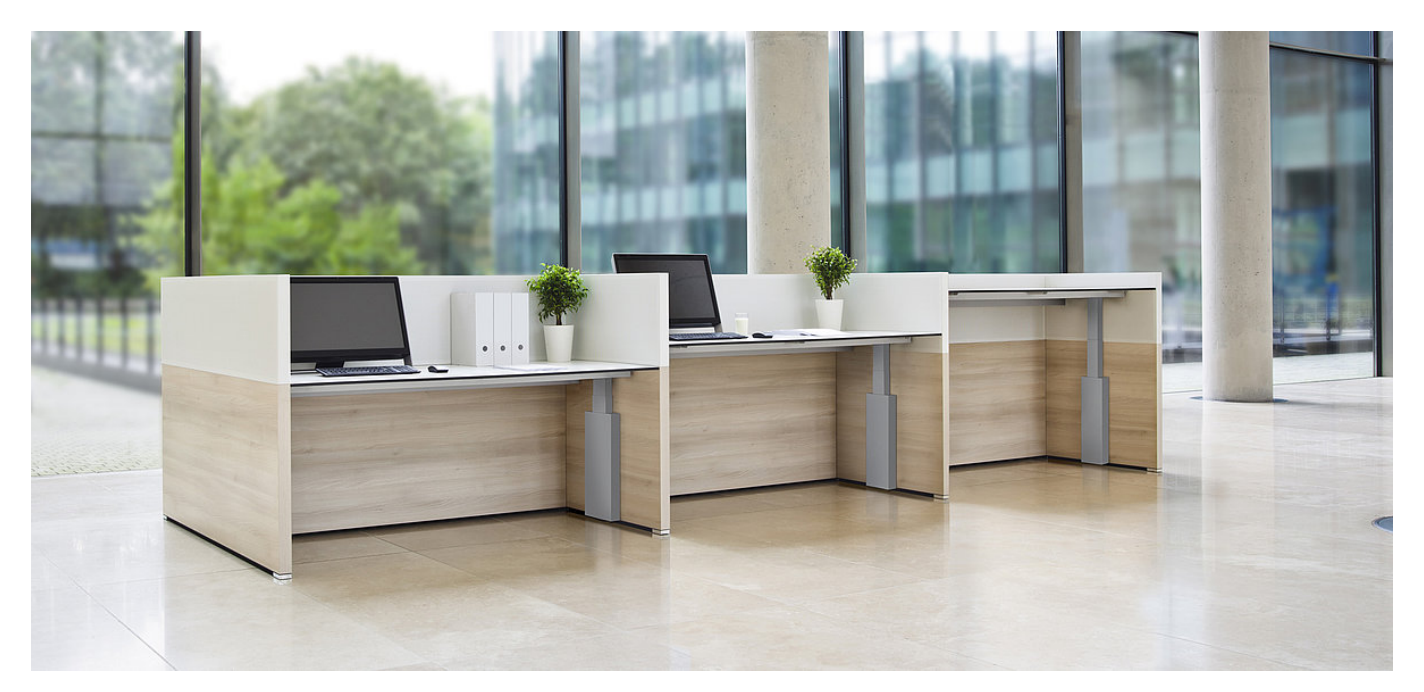
VARIO CONCLUSION, multiple workstation linear