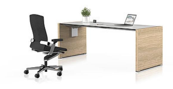
CONCLUSION Single Workstation