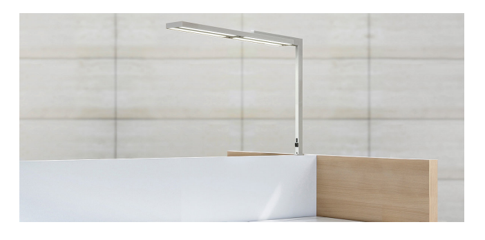
integrated workplace lighting