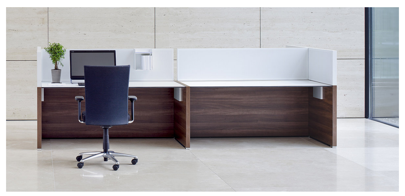
VARIO CONCLUSION, multiple workstation