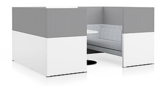
CONCLUSION Double Lounge