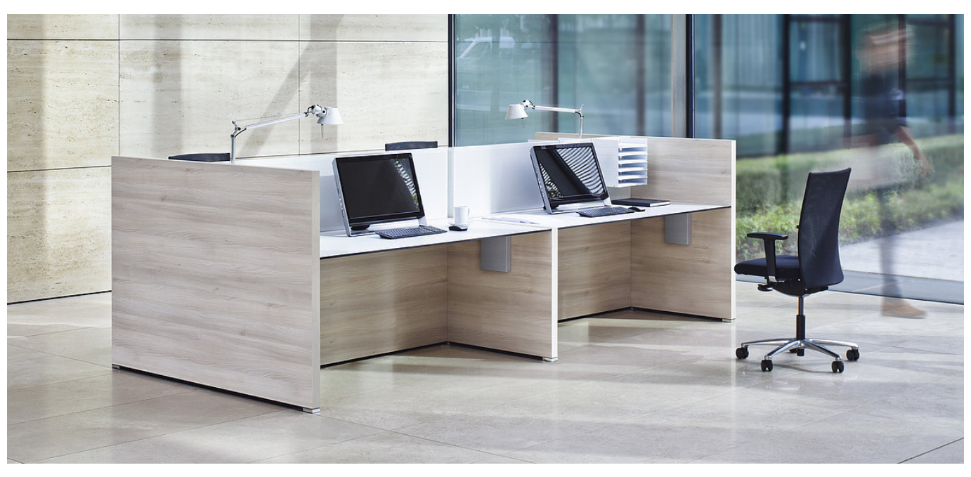
VARIO CONCLUSION, multiple workstation