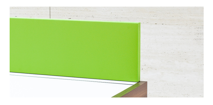
top piece with fabric covering