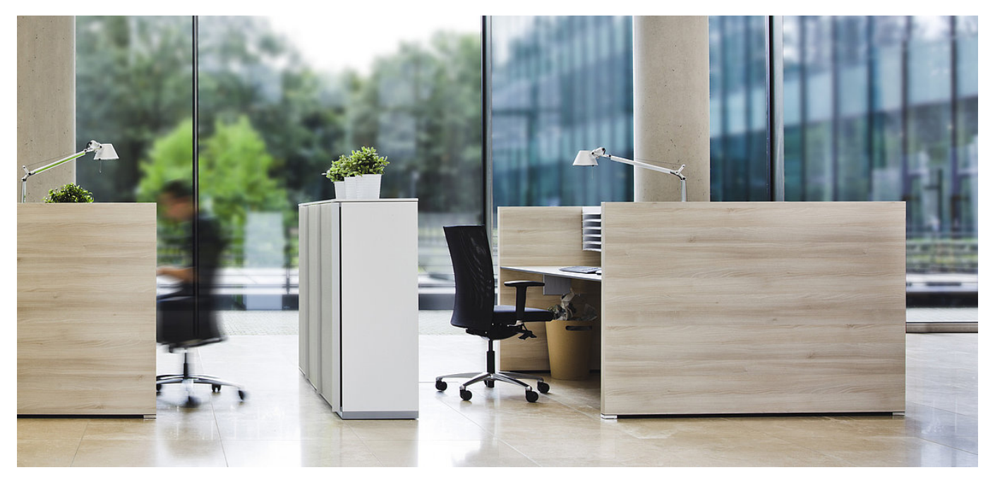
VARIO CONCLUSION , double workstations vis à vis