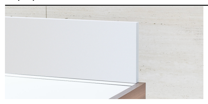
top piece with furniture surface