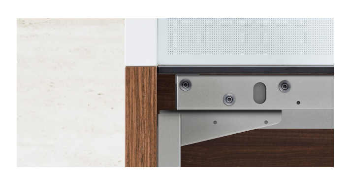
50 mm side and back walls