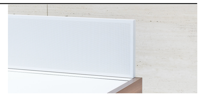
top piece with sound-proof surface