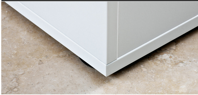
Adjustable sliding foot