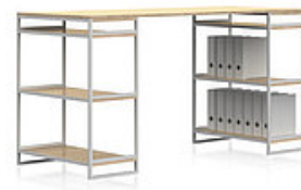
M1 Counterheight Table