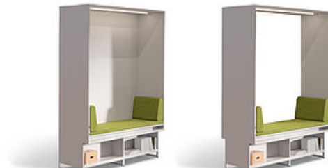
M1 Seating Niche