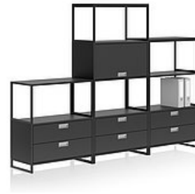
M1 Frame Element