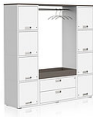
M1 Coat Rack