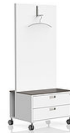
M1 Coat Rack mobile