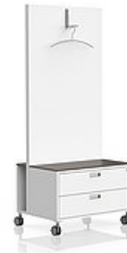
M1 Coat Rack mobile