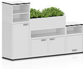
M1 Stackingbox Elements