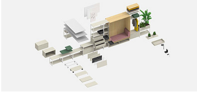
The System: M1