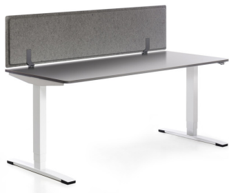
Privacy screen PET PORT