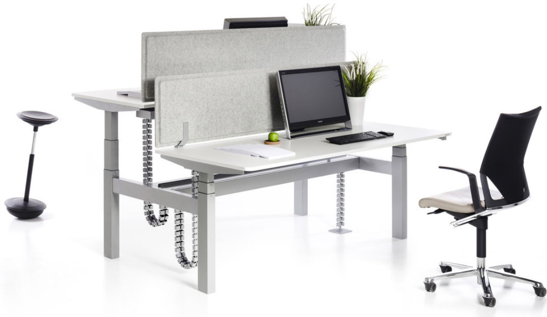
VARIO DUO 22 , double workstation with movable PET PORT screens