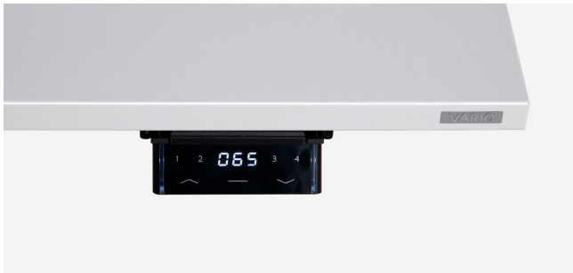
Height adjustment with memory/display