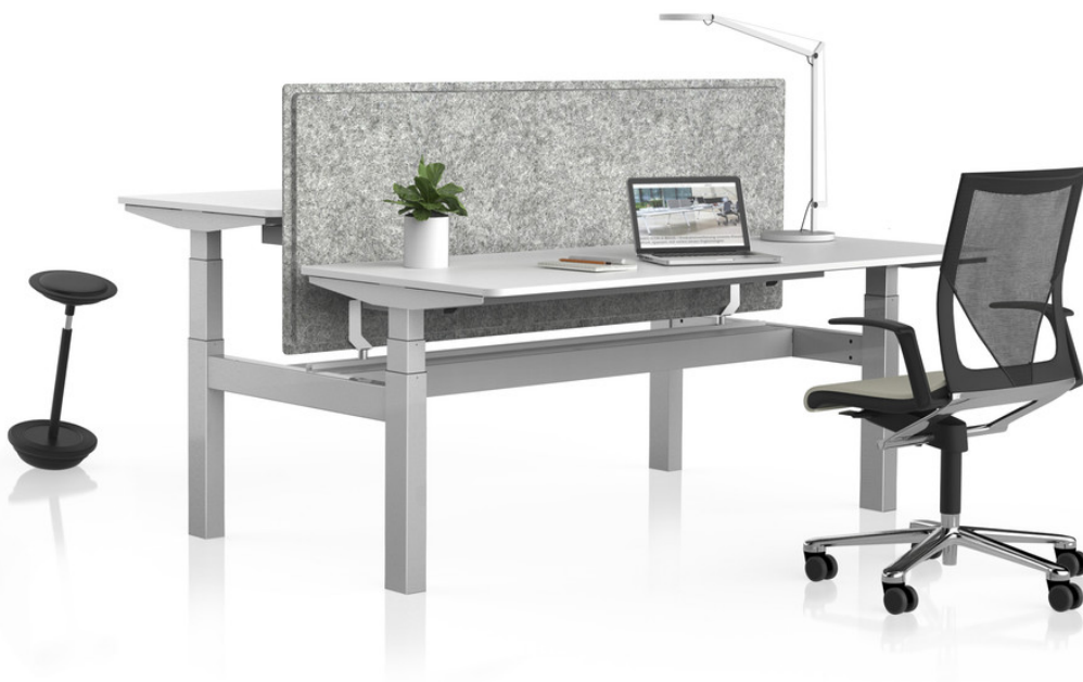
VARIO DUO 22 , double workstation with fixed PET PORT screen