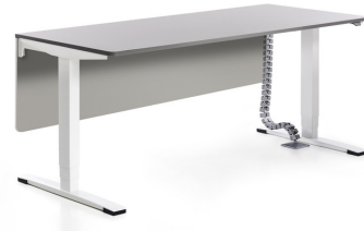
SOLO/DUO modesty panel