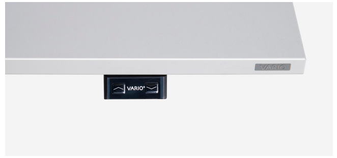
Height adjustment up-down