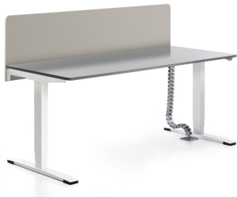
SOLO/DUO privacy screen