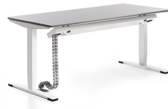
Cable tray opened inwards