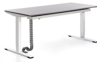
Cable tray with cable chain