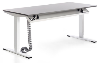
Cable tray opened outwards