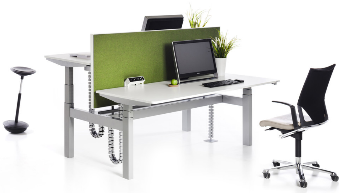
VARIO DUO 22 , double workstation with fixed S40 screen