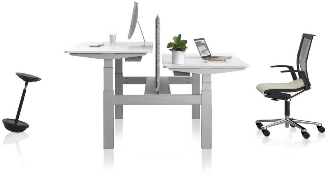
VARIO DUO 22 , double workstation with fixed PET PORT screen