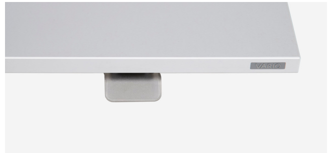
Height adjustment rocker switch