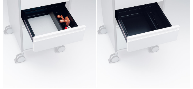
drawer fitting variant