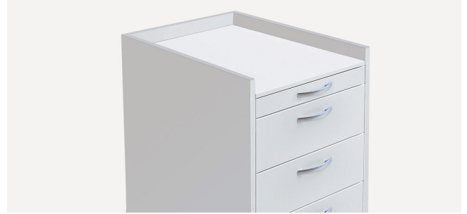
bow-type handle, oval