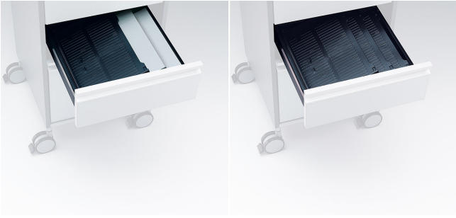
drawer fitting variant