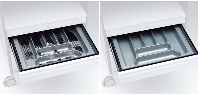
drawer fitting variant