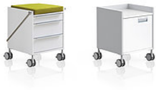
VERSA H MiniCaddy