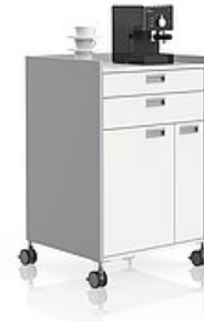
VERSA H CoffeeCaddy