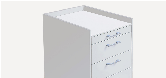
bow-type handle, angular