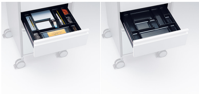
drawer fitting variant