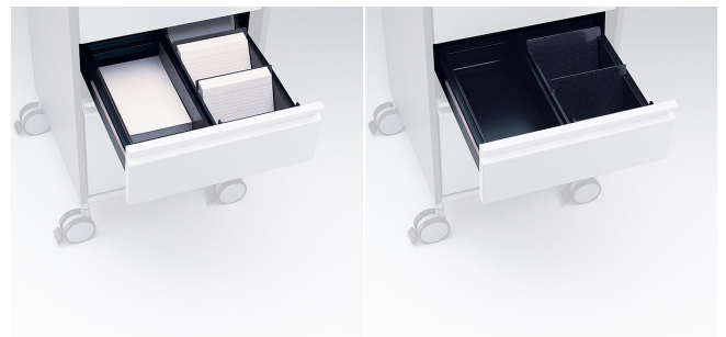
drawer fitting variant