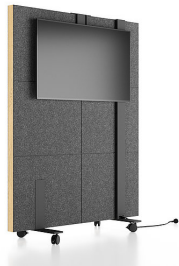
Screen holder with cable management