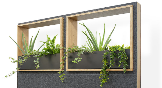
Built-in tray, flat with plant insert