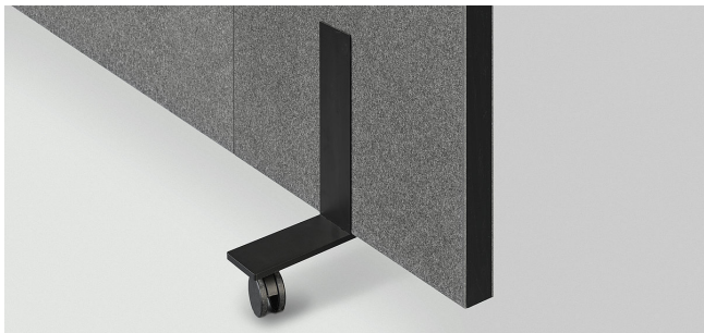
Double foot cantilever