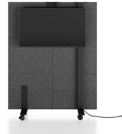
Screen holder with cable management