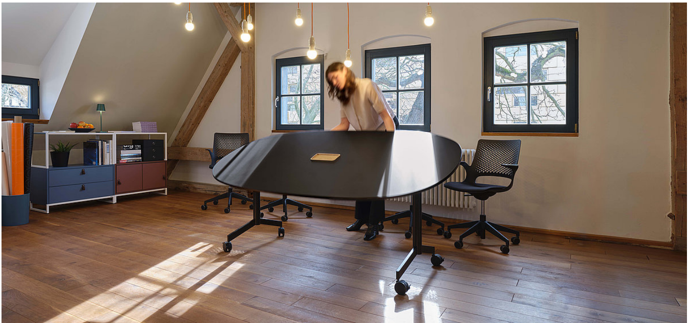
VARIO MOVE fixed height