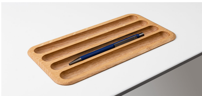
Small pen tray