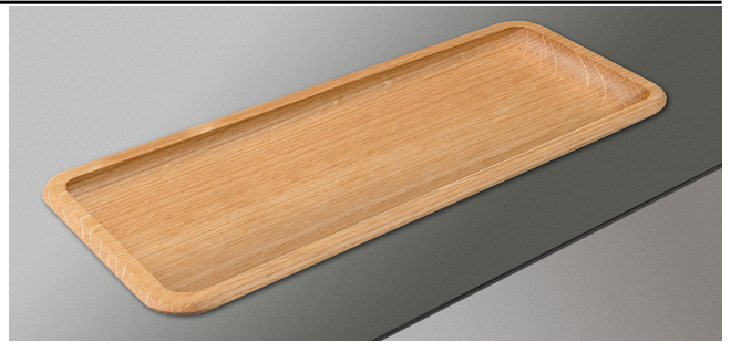
Large storage tray