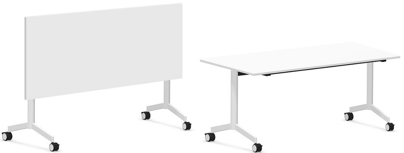
VARIO MOVE fixed height