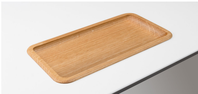
Small storage tray