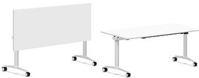
MOVE Sit-stand table