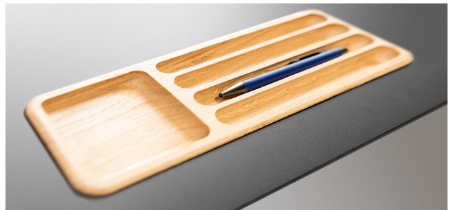
Large pen tray