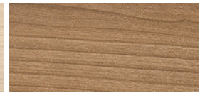
walnut decor light