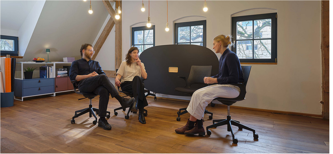
VARIO MOVE fixed height