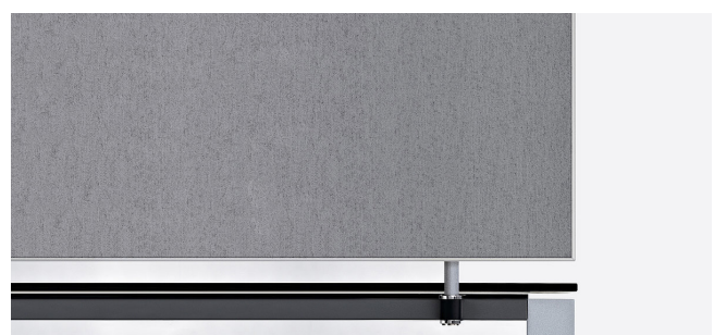
upholstered privacy screen S40