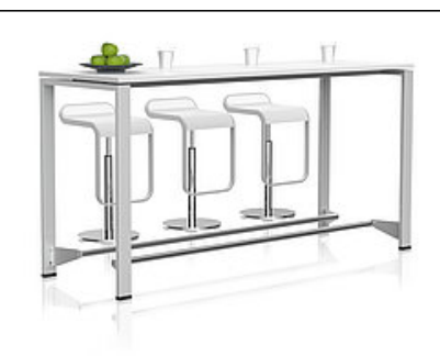
ICON Bistro counter height table