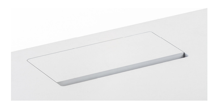
cable flap with brush