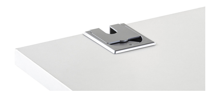
cable throughout with milling