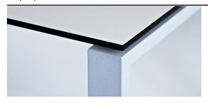
seemingly suspended desktop