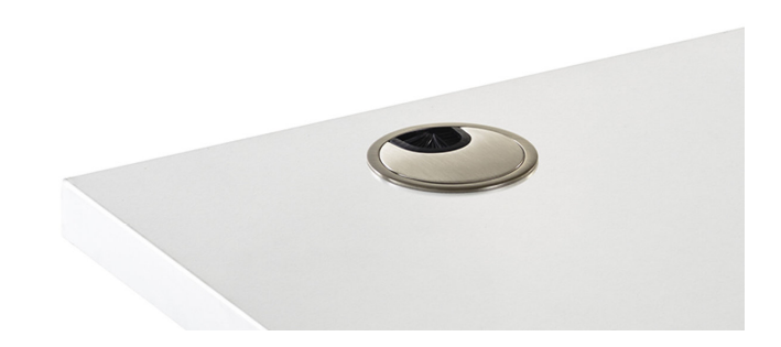
Cable throughout stainless steel Ø 60 mm