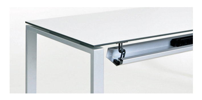
cable duct, opened