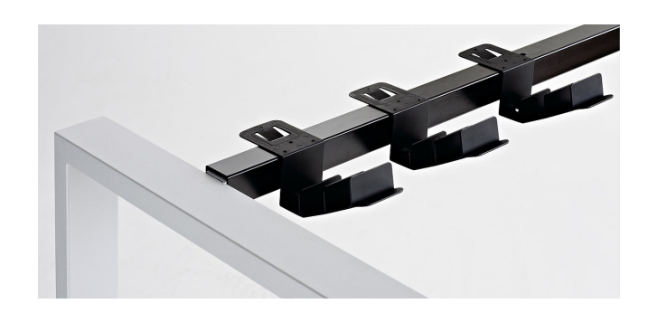
high function cable clips