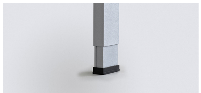
height adjustable frame