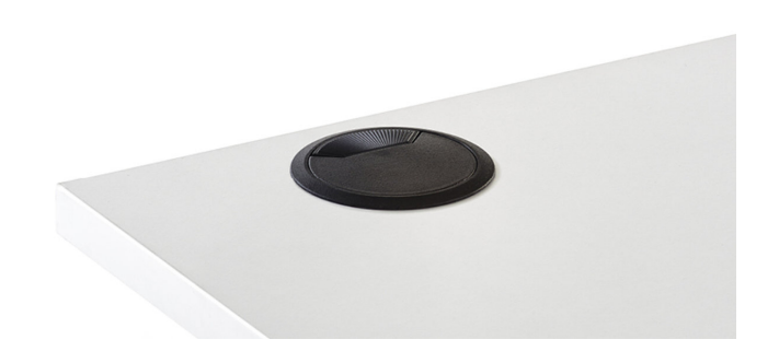
Cable throughout plastic Ø 80 mm