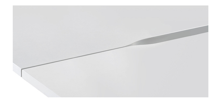
cable cutout on rear edge