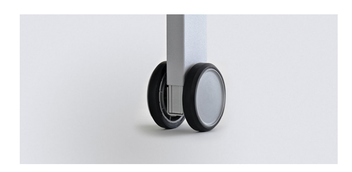
adjustable height – the mobile desk