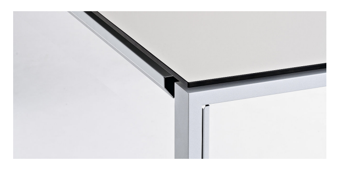
horizontal and vertical cable ducts