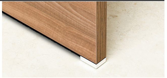
brush closure on bottom