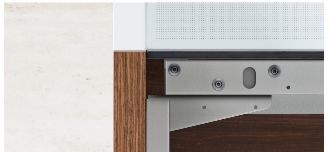
50 mm side and back walls