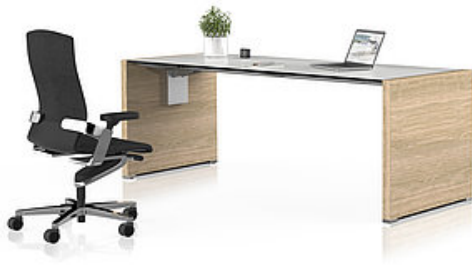
CONCLUSION Single Workstation