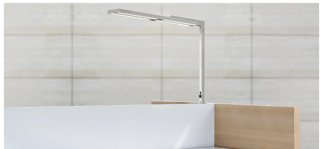
integrated workplace lighting