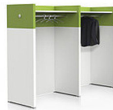
CONCLUSION Coat Rack