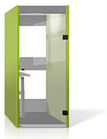
CONCLUSION Phone Box