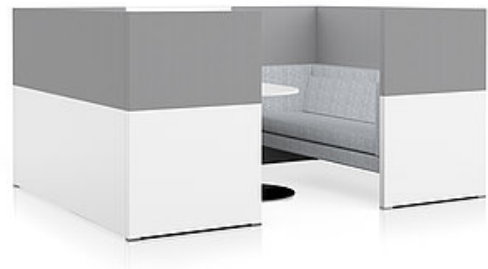
CONCLUSION Double Lounge