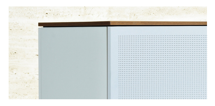
acoustic back panel attached