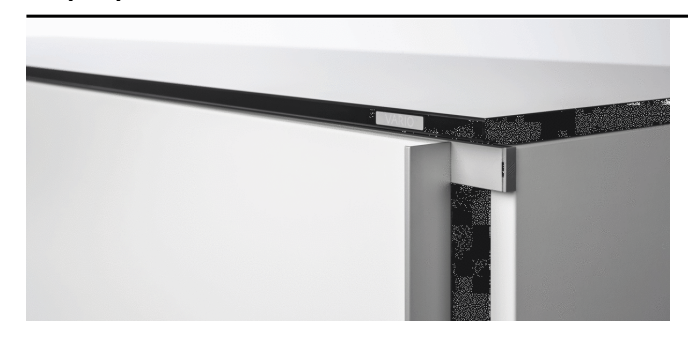
anodized aluminum track