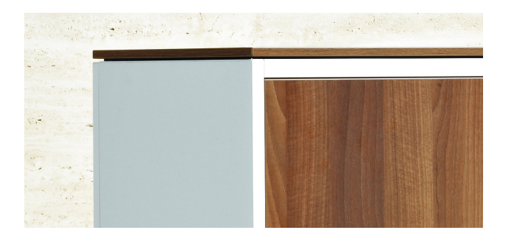
visible back wall attached with velcro