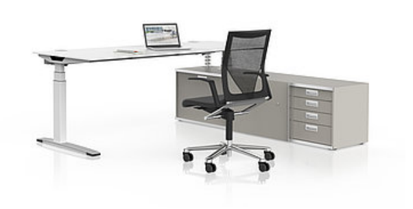
M7 trailer / STAGE SX