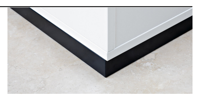
steel base 40 mm