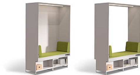
M1 seating niche