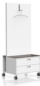
M1 Coat rack mobile