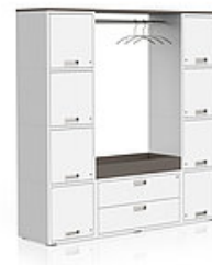
M1 Coat rack