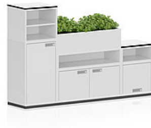
M1 Stacking Box Element